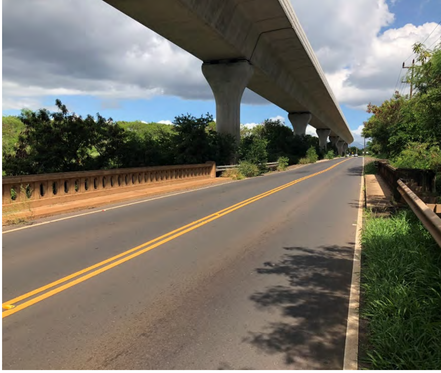
From the past, into the future; an alignment of old and new transportation modes in 'Ewa, west O'ahu